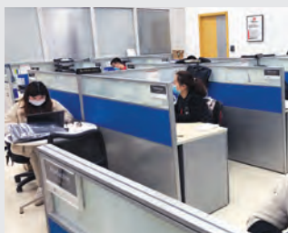
Masked employees social distance in cubicals.