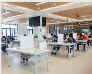
Employees practice social distancing on breaks.