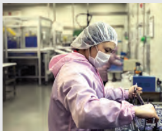
Employees on all shifts wear required PPE for protection.