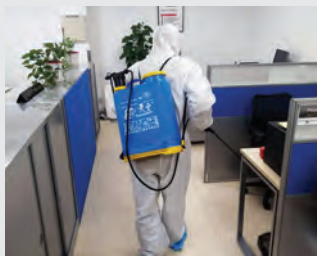
Regular disinfection occurs inside the facilities.