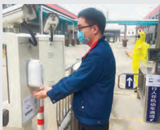
Employees sanitize hands at entrance and while inside.

A few of the operational changes that Prent Janesville adopted since the outbreak include staggered schedules to limit employee contact during shift changes and break times, work-from-home opportunities for non-essential to operations personnel, quarantine policies for those who test positive or have direct contact with someone who has tested positive, employee health monitoring, and factory disinfection.